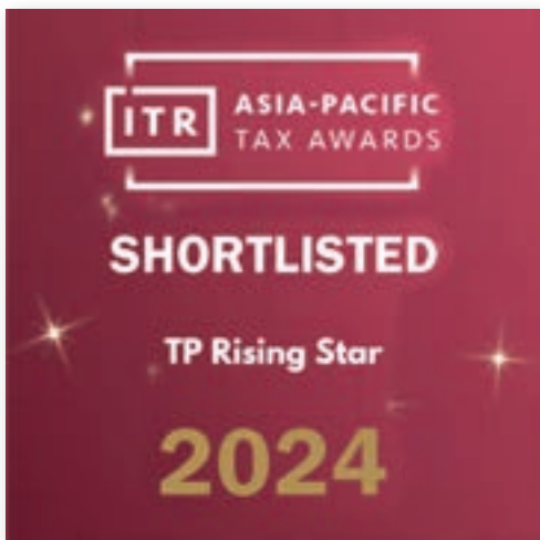
Our Awards & Recognitions