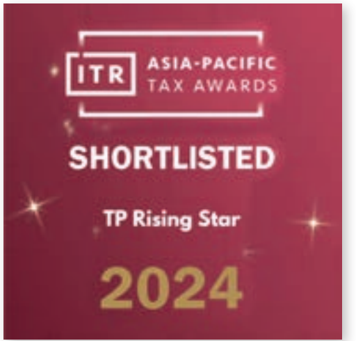
Our Awards & Recognitions